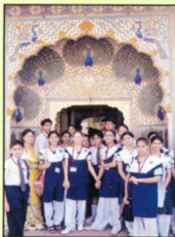
Our students at City Palace Jaipur (Rajasthan)