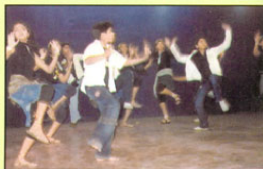
Bubbling with joy-Our students in the Valedictory Function of the L.A.