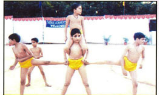
Health is Wealth and Body is the Bank- Malkhamb

We returned home at 5 p.m. The programme was over. Our annual function was over but it remained alive in the newspaper columns for many days to come and will remain alive in our memories for ever.