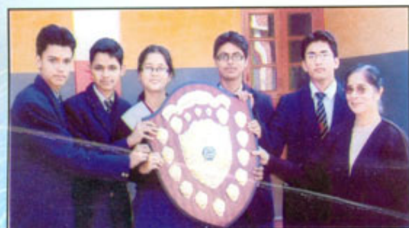
House of the year- Teresa House