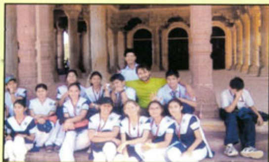
Our Students at Fort Palace-Jaipur (Rajasthan)

After having our dinner we went back to our hotel. The next day after early breakfast we were ready for a full day trip to Ajmer and Pushkar. Pushkar as Hindu Mythology says is a place where gods released a swan with a lotus in its beak and let it fall on earth where Lord Brahma would perform a grand Yagna. The place where the lotus fell was called Pushkar. It is situated 14 kms away from Ajmer and is one of the five sacred dhams. Pushkar is also known for its temples built by different rulers. But due to lack of time we could only see the most famous 'Brahma Temple', said to be the only temple in the world dedicated to this deity. The beautiful temple is made with white marble. The temple priest told us the whole history of the making of this temple and also showed us many beautiful idols of Lord Brahma and Vishnu inside the temple. We also saw Pushkar Lake which is a sacred lake where pilgrims descend to bathe in the sacred waters. Pushkar is also known for its annual