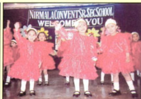
Rose buds of our garden-our tiny tots on their Annual Function