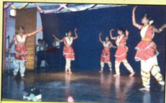
Celebration of the Teachers' Day A Dance Recital