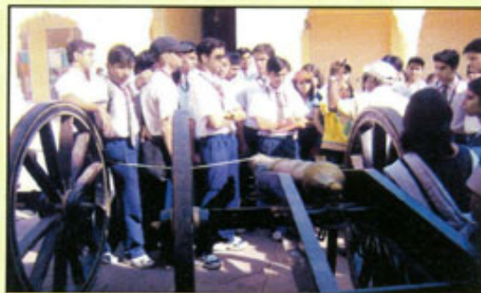
Our Students At Jaipur Fort

After having our dinner we went back to our hotel. The next day after early breakfast we were ready for a full day trip to Ajmer and Pushkar. Pushkar as Hindu Mythology says is a place where gods released a swan with a lotus in its beak and let it fall on earth where Lord Brahma would perform a grand Yagna. The place where the lotus fell was called Pushkar. It is situated 14 kms away from Ajmer and is one of the five sacred dhams. Pushkar is also known for its temples built by different rulers. But due to lack of time we could only see the most famous 'Brahma Temple', said to be the only temple in the world dedicated to this deity. The beautiful temple is made with white marble. The temple priest told us the whole history of the making of this temple and also showed us many beautiful idols of Lord Brahma and Vishnu inside the temple. We also saw Pushkar Lake which is a sacred lake where pilgrims descend to bathe in the sacred waters. Pushkar is also known for its annual