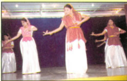
A semi-classical dance being staged in the valedictory Function of the Literary Association

assembly of 14 November very interesting and memorable for the students by putting up a variety entertainment programme for the students which included songs, dance and speeches. Drawing and essay writing competitions were also held for the students.