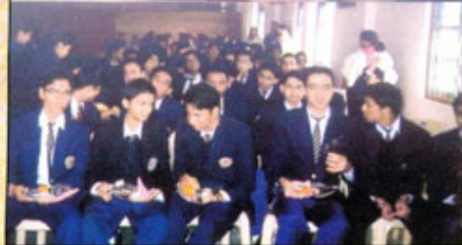
The Outgoing Students of Class XII At the Farewell Function

(III) The feast of Blessed Mother Bridget of Jesus, foundress of the Congregation of Ursuline Sisters was celebrated with joy and enthusiasm on 3 September. A special morning assembly was conducted to mark the occasion. The life and the services of Mother Bridget were high lighted in a speech delivered and a group-song sung on the occasion.