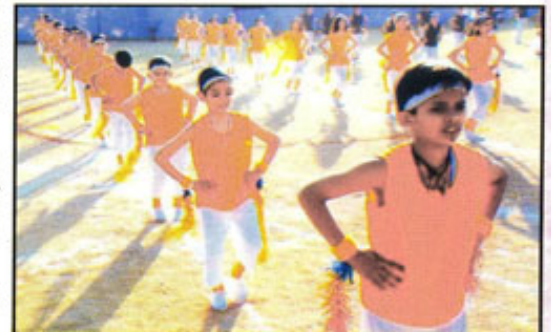
If you keep fit you are always hit-a performance based on aerobics.