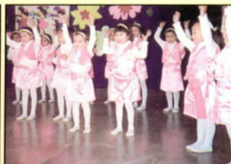
Rose buds of our garden-Our tiny tots on their Annual Function