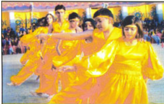
A thing of Beauty is a joy for ever - a rhythmic group dance

'Blitzreig' or lightening attack was a display of marshal art. Young students of class VII and VIII performed excellently with sticks and empty handed. Viewers remained spell bound to see how 'the fist of fury' smashed a thick wooden stick into pieces.