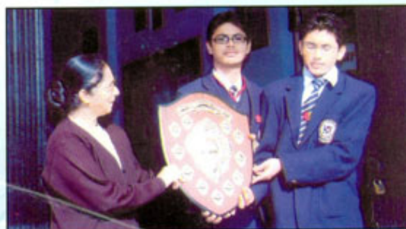
Teressor House Tops in Athletics