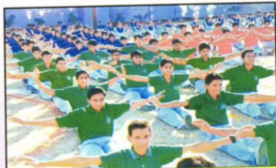
Keep the doctor away- a grand mass P.T. display

"Kadam Kadam Badha ye ja Khushi Ke Geet Gaye ja Ye zindagi hai Kaum Ki Too Kaum Pe loota ye ja."