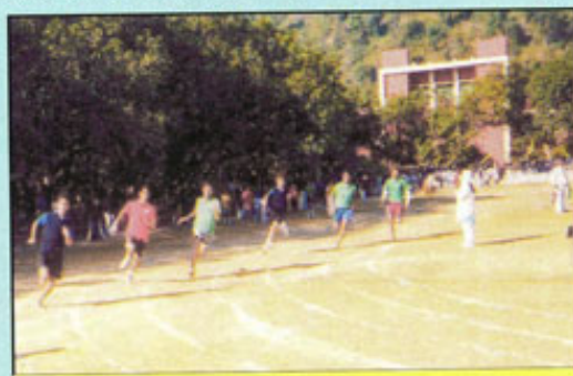
A race in progress

When the races were over throws and jumps began. Shot Put and Discuss Throw were interesting items in which the participants displayed their strength. Our announcers encouraged them with interesting comments.