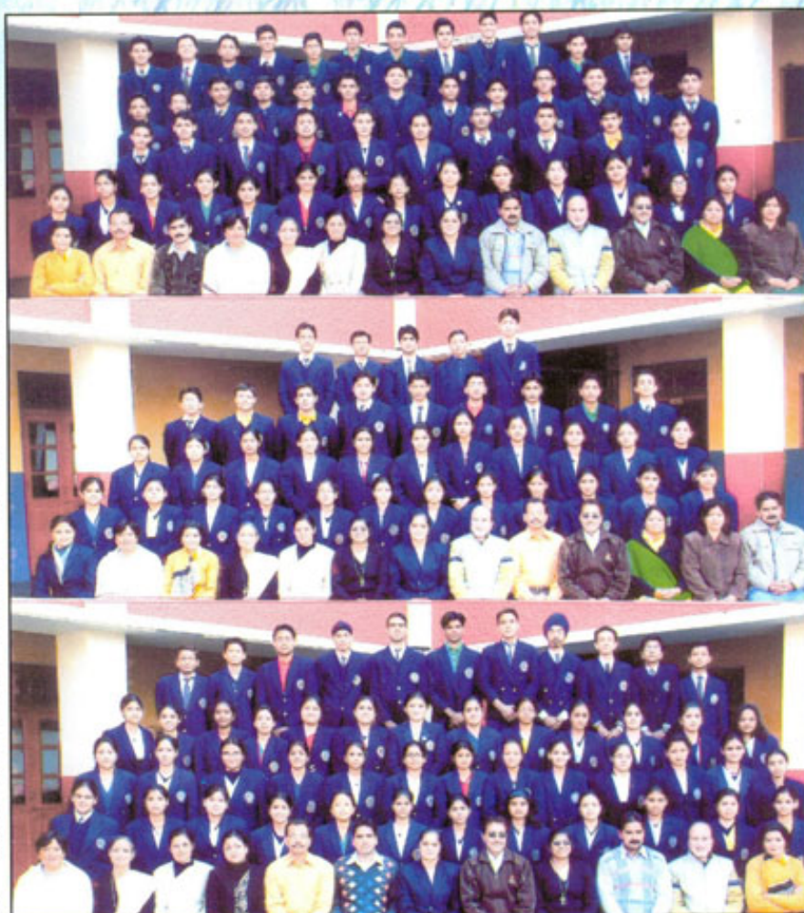
The Outgoing Students of Class XIIA, XIIB & XII C (Commerce) with The Principal, the Manager & Their Teachers

20. Prize Distribution : It was held on February 26. Athletic Championships, House Championship and sports prizes to the students of the primary classes were given on the occasion. With this the academic session was over.