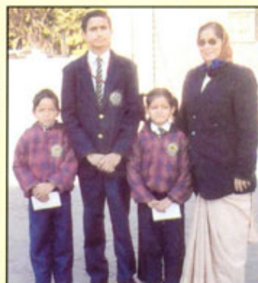
Congratulations! cash prize winners in the National science Olympiad with the Principal