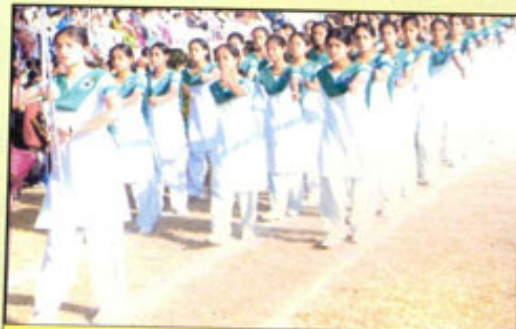
An impressive March Past Independence Day

(ii) Gandhi Jayanti : A special morning assembly was conducted on the eve of Gandhi Jayanti by the students of Class VI B in which homage was paid to the Father of the Nation.