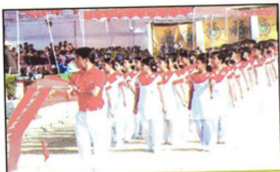
Marching on from success to success Students of Nirmala

The school playground which, untill now looked like a saint in meditation wore a totally different look. Now it looked like a young sportive child brimming with joy and bubbling with enthusiasm. None else but we changed the look of the ground as we brushed up our performance on it. We danced, we marched, took exercises and did everything that could make our annual function the most memorable one.