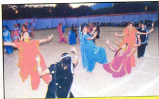
Sinduri Mooti De Bol a Punjabi Folk Dance